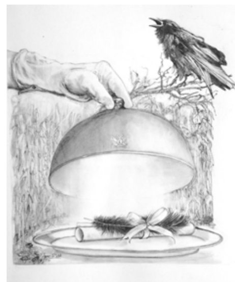
The Feast - Illustration